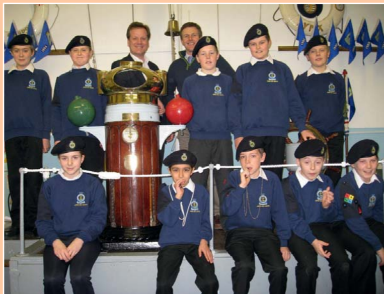
The Sea Scouts – a great learning activity for kids!