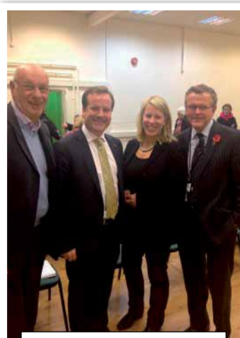
Listening to Deal traders

"The team is now engaged in plans for the whole of 2013 beginning with a French themed event in mid March."