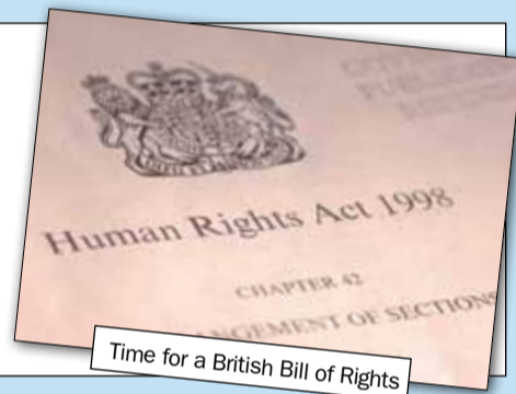
Time for a British Bill of Rights