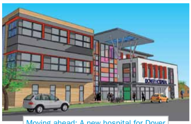
Moving ahead: A new hospital for Dover