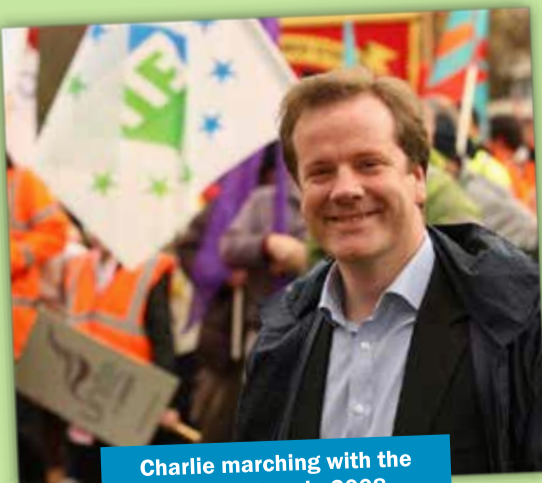
Charlie marching with the port workers in 2008

We've come a long way since 2010. We stopped Labour's port sell-off. We're getting a people's port. We're securing the investment Dover has needed for decades.