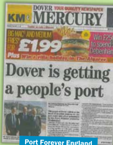
Port Forever England

A people's port is rising at the docks. There will be community directors. The port is setting up a fund to benefit our community.