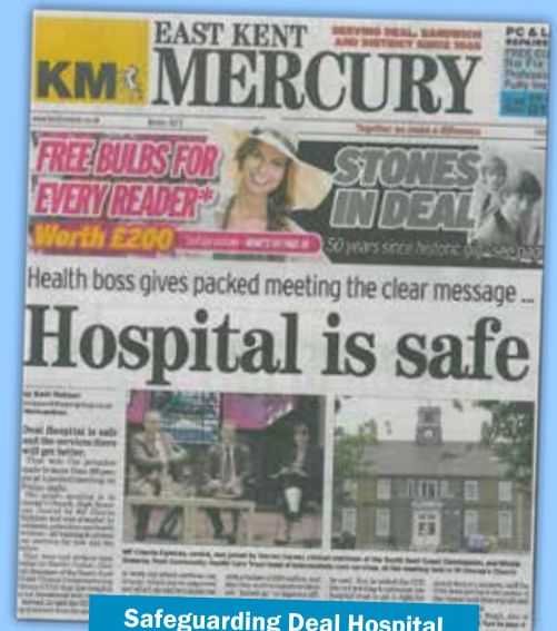
Safeguarding Deal Hospital

He is working hard to secure more local clinics and outpatient services for the most vulnerable in Deal.